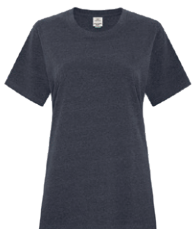
EARTH NAVY 2379C