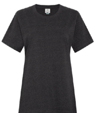
EARTH BLACK Black 6C

Textile fabric colours are subject to dye lot variation and will not be exact match to print Pantone reference.