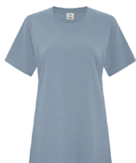
EARTH STONE BLUE 2157C