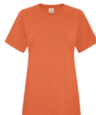
EARTH ORANGE 7579C