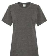
EARTH PEWTER Black 7C