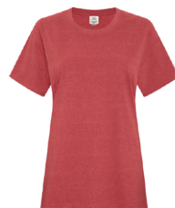
EARTH RED 202C