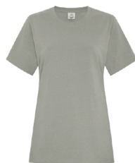
EARTH DOVE 416C