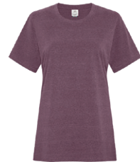
EARTH EGGPLANT 262C