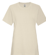
EARTH BONE 7534C