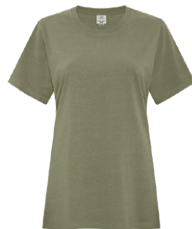
EARTH MILITARY 7770C