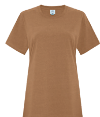
EARTH CARAMEL 7568C