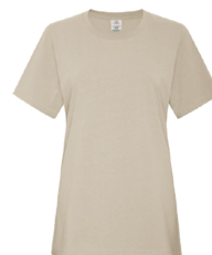
EARTH SAND 7527C