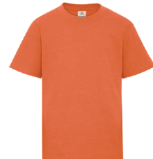
EARTH ORANGE 7579C