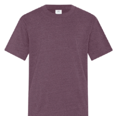
EARTH EGGPLANT 262C