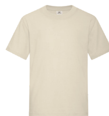
EARTH BONE 7534C