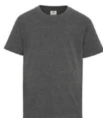
EARTH PEWTER Black 7C