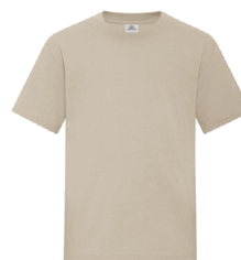
EARTH SAND 7527C