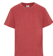
EARTH RED 202C