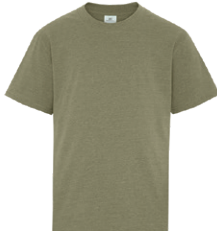
EARTH MILITARY 7770C