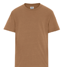
EARTH CARAMEL 7568C