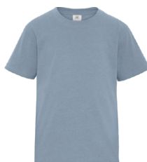
EARTH STONE BLUE 2157C