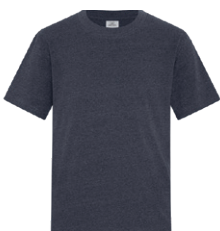
EARTH NAVY 2379C