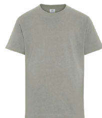
EARTH DOVE 416C