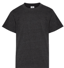
EARTH BLACK Black 6C

Textile fabric colours are subject to dye lot variation and will not be exact match to print Pantone reference.