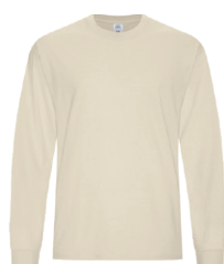
EARTH BONE 7534C