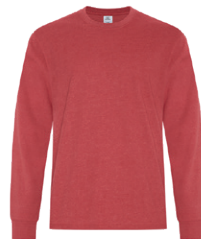
EARTH RED 202C