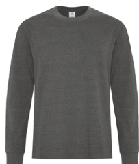
EARTH PEWTER Black 7C