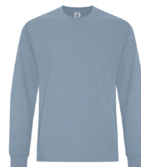
EARTH STONE BLUE 2157C