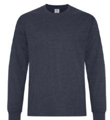
EARTH NAVY 2379C